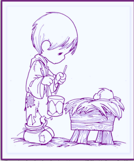
Illustration: Sam Butcher, Precious Moments, I'll Play My Drum For Him